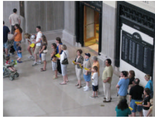
At times, the crowd stretched all the way around the Rotunda