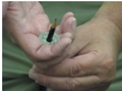
Elmer Deffenbaugh shows a coin penetration with the Opium Coins; the half dollars change to Chinese coins