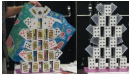
Watt bought a card castle made in India. One side is made up of random cards, the other is all the chosen card