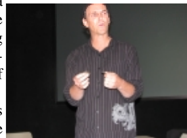
Pace's Coins Across