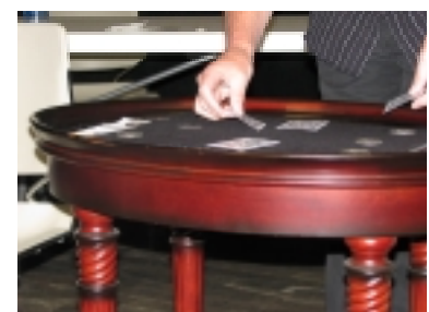
Pace's camouflage coins