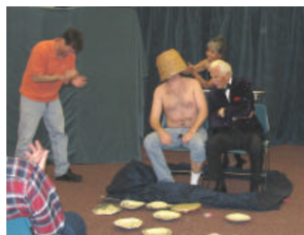
Calvert demonstrates a rope escape inside his Spirit Cabinet.