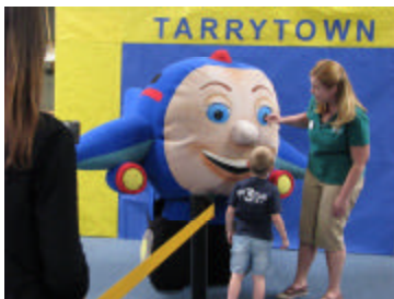
Jay Jay the Jet plane