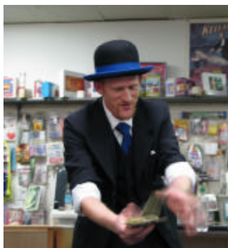
The Heinstein Shuffle

One of Karl's signature effects is the "Heinstein Shuffle," a false riffle shuffle so good it's almost impossible to tell from the real thing, yet the order of the deck is left undisturbed.